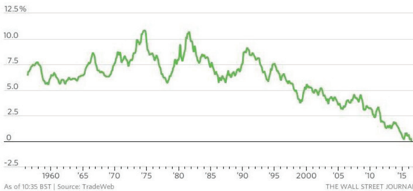
Yield on German 10-Year Bond